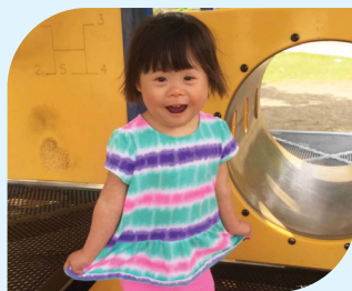
Children with Medical or Developmental Needs