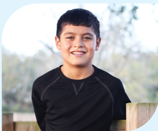
Physically Healthy Child Age 8+ years

In reality, there is no definition of who becomes “waiting,” but the kids tend to be one or more of the following: